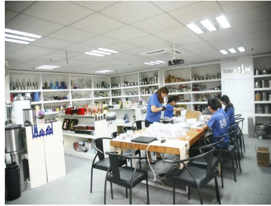
Show Room 1