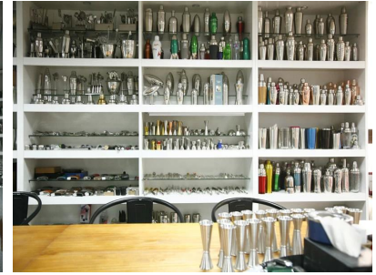
Sample Room 2