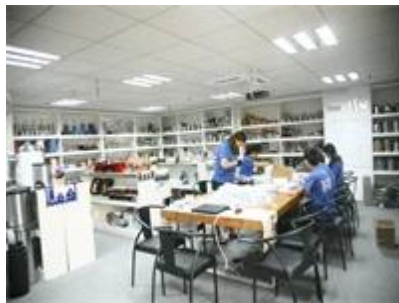
Sample Room 1